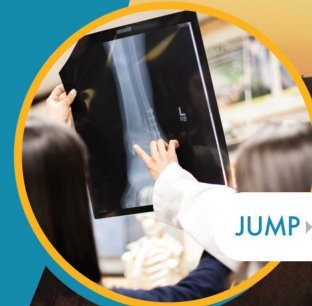
JUMP Junior Upcoming Medical Professionals