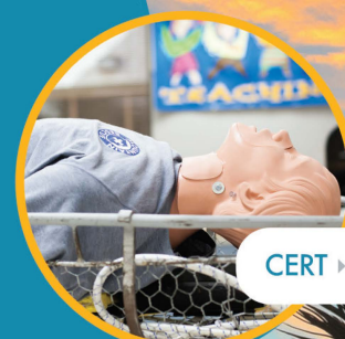
CERT Community Emergency Response Team